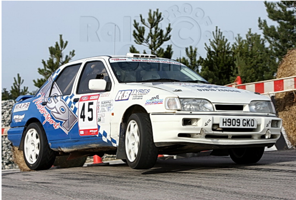
Dave Boden (a BARS licence holder)