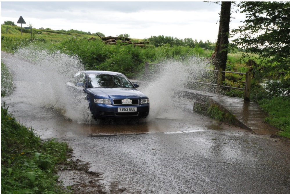
Ian & Christine Vout on the 2012 Welsh Tour

This time the event was run over three days rather than the 24 hours of the original. It still covered 400 miles which were on roads as close as we could get to the original roads used in 1953. The tests included were all held on private ground but maintained the competitive element of those undertaken on the original events. This time around the competitors spent the night in the comfort of an hotel rather than in the discomfort of the car they were competing in. A good time was had driving around the Welsh borders and spending a considerable amount of time discussing the finer points of anything and everything with fellow enthusiasts.