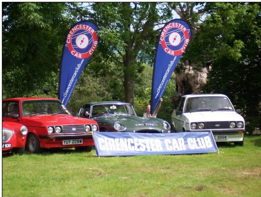
Cirencester Car Club at Prescott